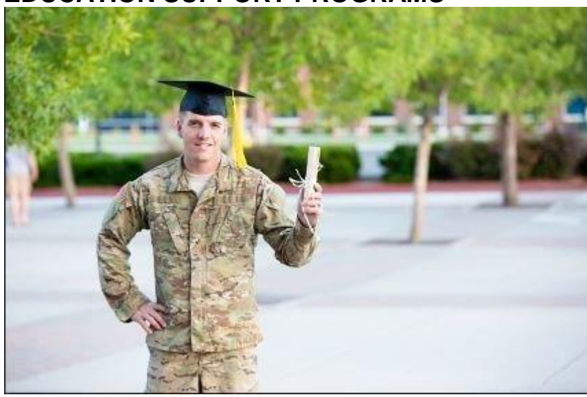
Chapter 7: EDUCATION SUPPORT PROGRAMS