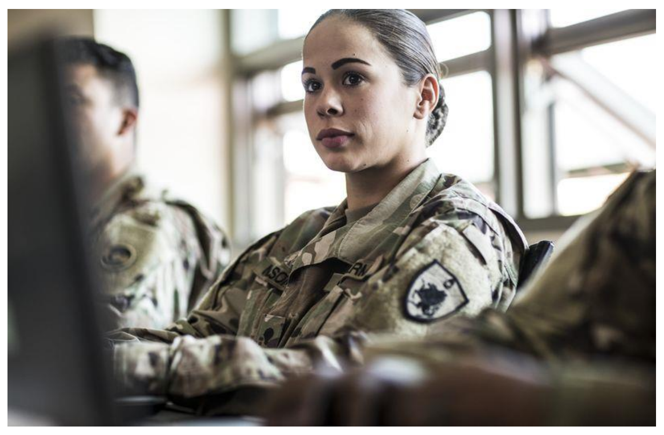
Chapter 6: TESTING PROGRAMS