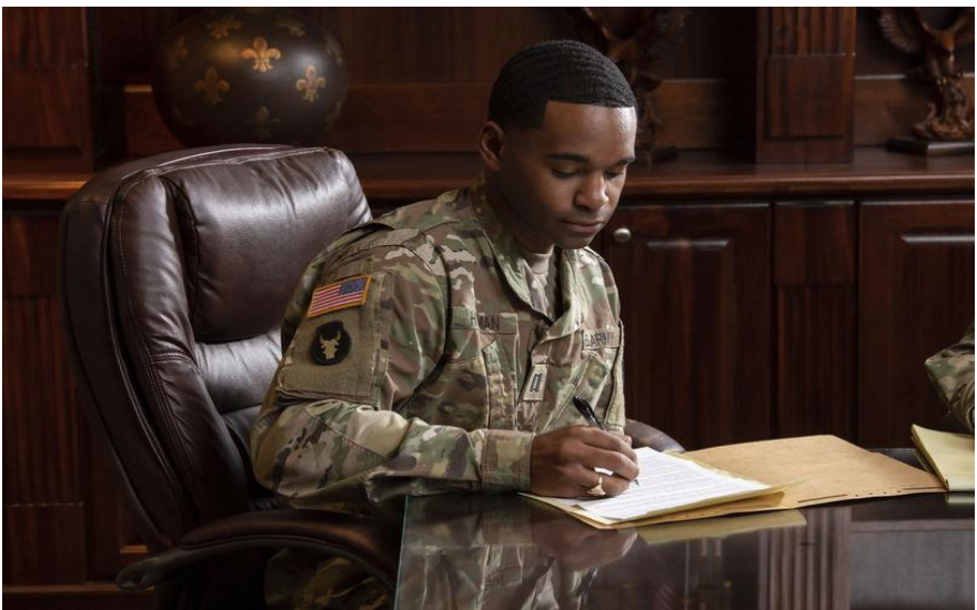
Chapter 8: ARNG EDUCATION INCENTIVES