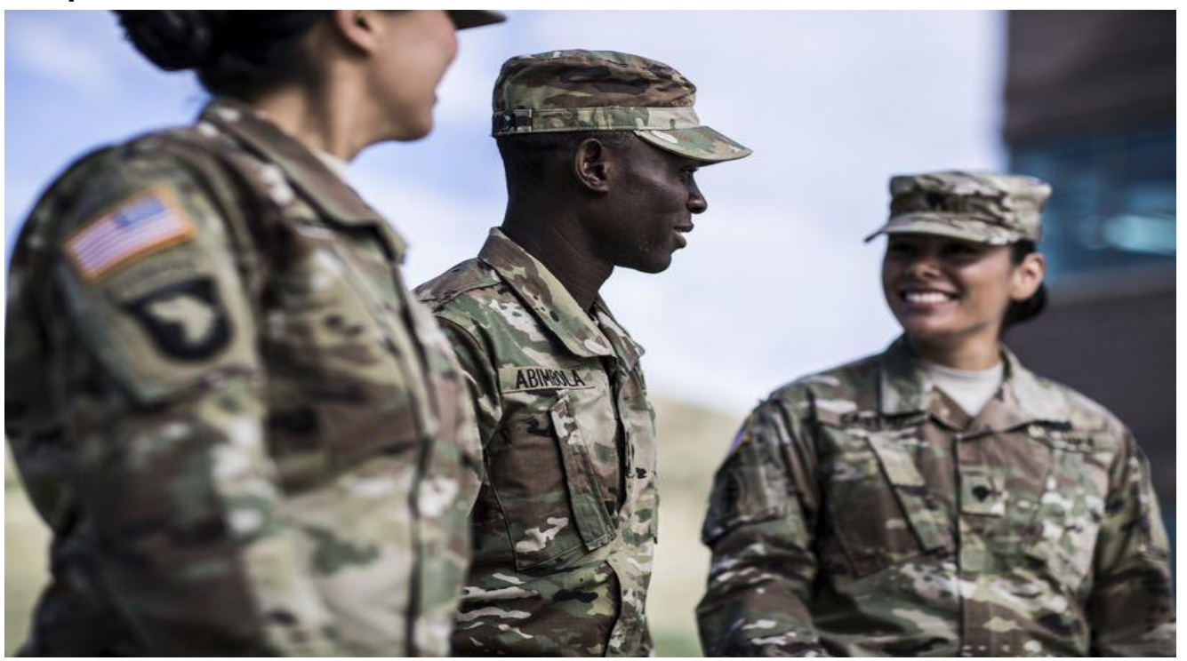
Chapter 1: INTRODUCTION AND RESPONSIBILITIES